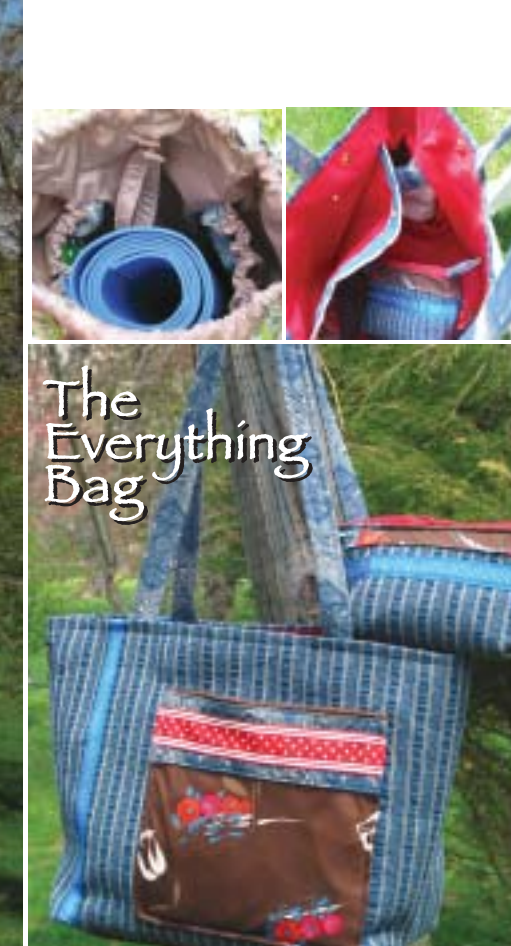
The Everything Bag