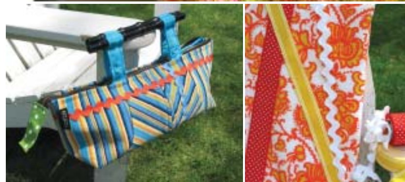
This Season's Funky Finds